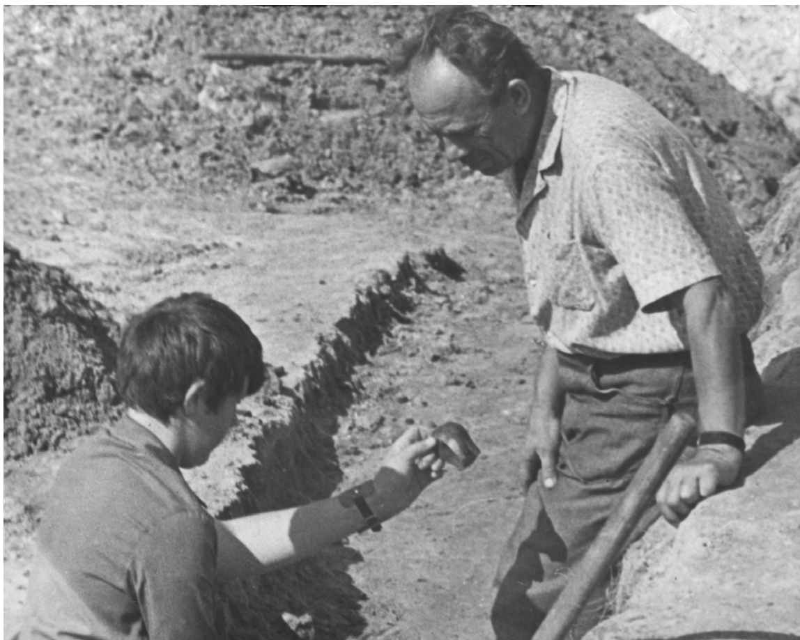
Fig. 3. Exploration of upper cultural layer. Kremenets (Kulychivka site). 1973