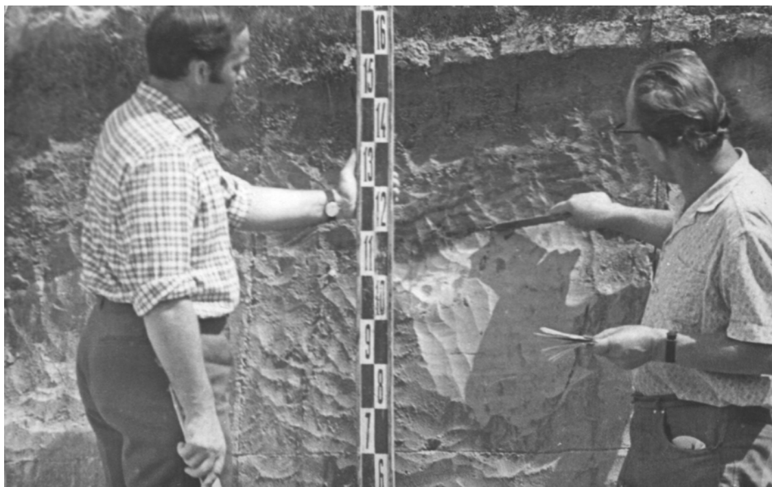
Fig. 4. During description of stratigraphy. Kremenets (Kulychivka site). 1973

In 1979 new cultural layer III was discovered at the first time on southern part of excavated area. It was investigated initially in 1976. At that time only two layers were noted there. The reasons why V. Savych returned to already excavated (according to his field report from 1976) sector of the site are not explained on the pages of his publications or in field documents. Typology of the complex of flint artifacts from layer III and the peculiarities of production of blanks allowed V. Savych to conclude about presence of significant archaic features in this collection. According to researcher's opinion, these characteristics confirmed genetic link between local Middle and Late Paleolithic. That is why, he interpreted layer III as a site of transitional period (between Middle and Upper Paleolithic) – initial stage of Late Paleolithic. Researcher considered such sites as Radomyshl, Korman IV (layers 7–8), Vogelherd (Germany), Willendorf, Bečov, Golodec, Jeneralka (Czech Republic and Slovakia) as analogies for this site [Савич, 1995, с. 22–25].