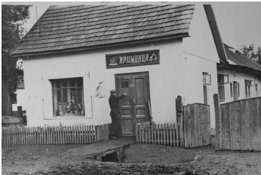
Foto 5. The archived photograph of Istvan Pasztellak, a member of the political group of Galoch, while showing where they placed their flyers 5 Фото 5. Архівна фотографія Іштвана Пастеллака, члена політичної групи з Галоча, під час показу, де вони розмістили свої листівки