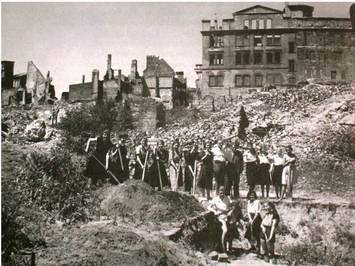
Fig. 3. Archaeological research in Gdańsk. Рис. 3. Археологічні дослідження в Гданську.