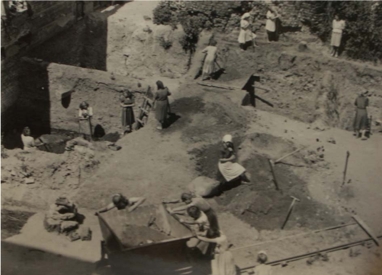
Fig. 4. Archaeological research in Ostrów Tumski in Wrocław. Рис. 4. Археологічні дослідження на Остріві Тумський у Вроцлаві.

millennium research (largely based on the results of research from 1938–1939, 1946–1953), the concept of the form and function of the Poznań castle did not receive the final monograph summarizing the partial theses arising in the course of the research, but the basic approach to this problem can be read from successively published scientific and popular science studies [Hensel, 1953; 1958, 1960; Hensel, Żak, 1964].