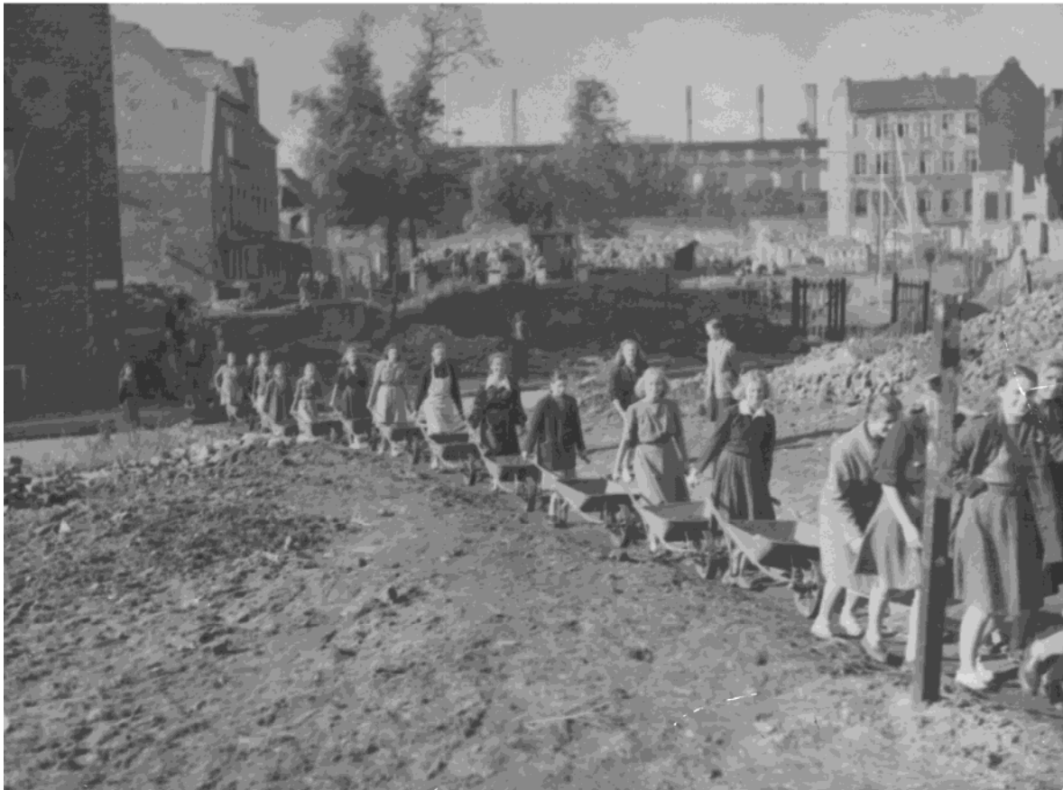
Fig. 2. Archaeological research in Szczecin.